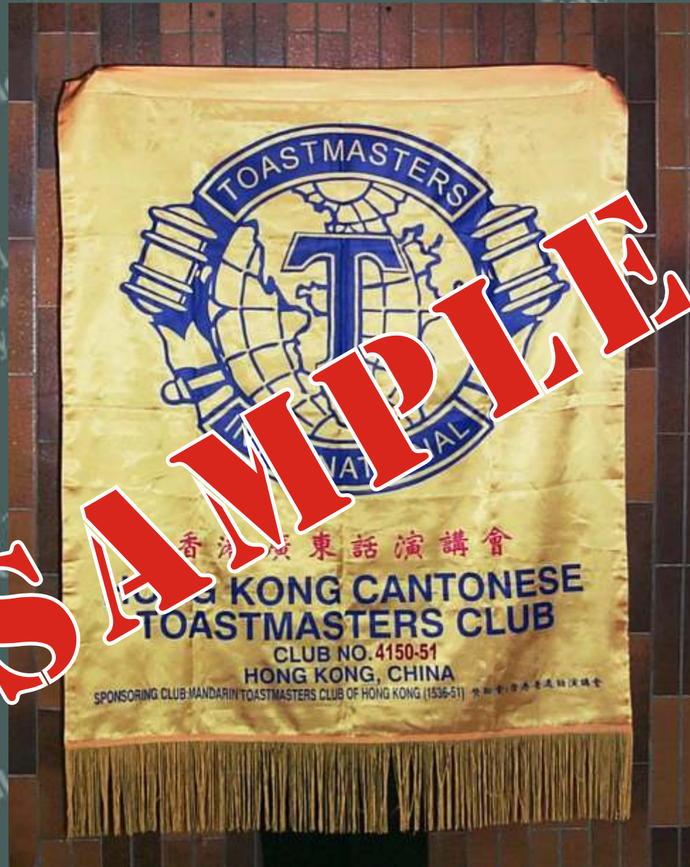
The logos, trademarks or company name belong to their respective owner.